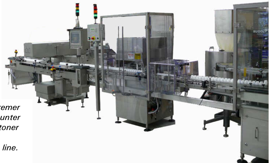
Right: Cremer tablet counter with cottoner in tablet counting line. counter