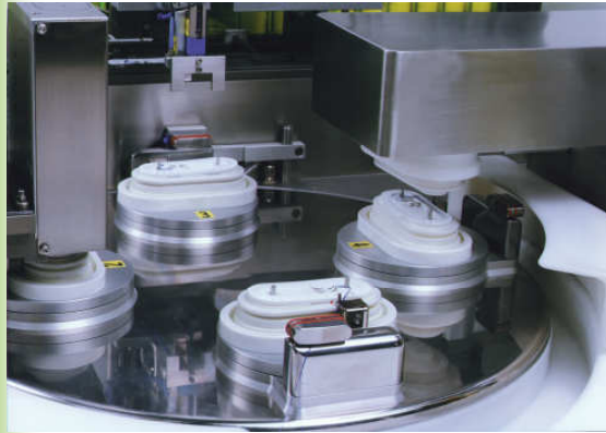
Suture winding with clean room robots

Sterile depot and implant assembly machinery