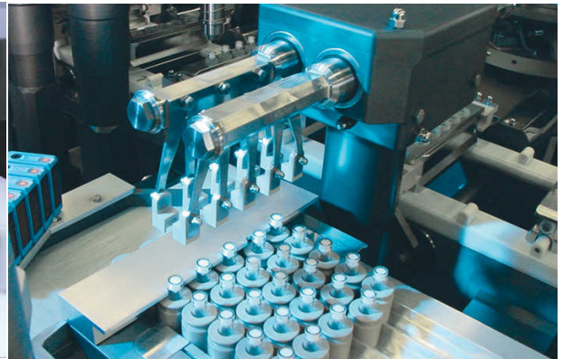
Needle free syringe assembly under Class A conditions